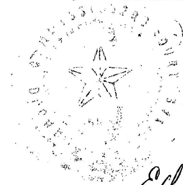
Exhibit # 12 September 19, 2005